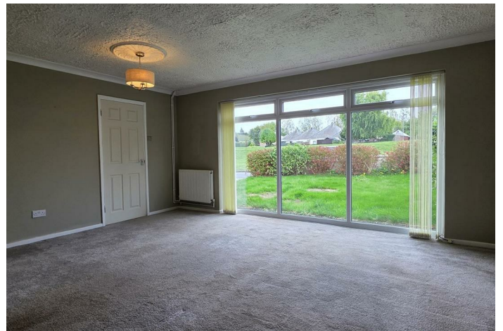
Bungalow (EPC Rating: D)

21 BAKERS FURLONG, HEREFORD, HR4 7SB £950 Per Calendar Month